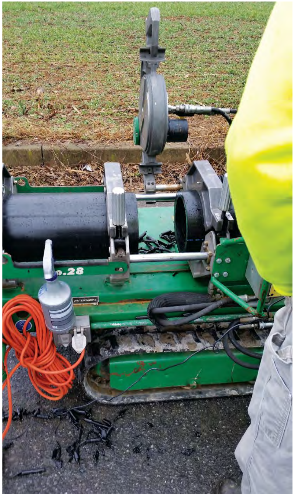
The HDPE pipe for the project was fused together in accordance with ASTM Standards F2620 and F3190 before it was installed with horizontal directional drilling.