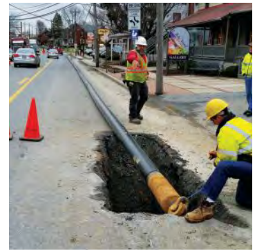
On the Cover HDPE pipe network improves Amish communities' water quality.

JANUARY 2019 PUBLISHED 12 TIMES PER YEAR VOLUME 58, NO. 1