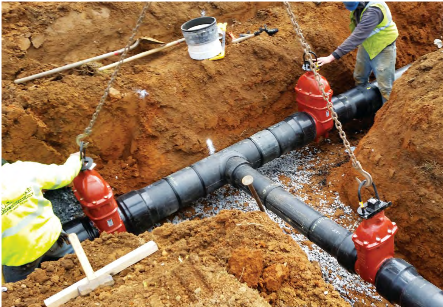
The new system uses 52,000 ft of HDPE pipe plus more than 200 valves with HDPE fusible ends and 69 fire hydrants, which were heat-fused into the system. The distribution system will be connected to a 900,000 gpd water treatment plant that is expected to be completed in 2020.

the Project of the Year Award for the job by the association's Municipal and Industrial Division. The Projects of the Year is an annual event for PPI, the major North American trade association representing all segments of the plastic pipe industry.