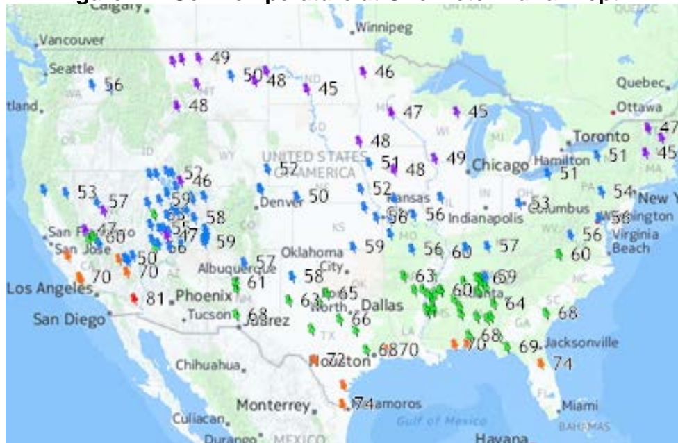
Figure A2: Soil Temperature at One Meter Burial Depth